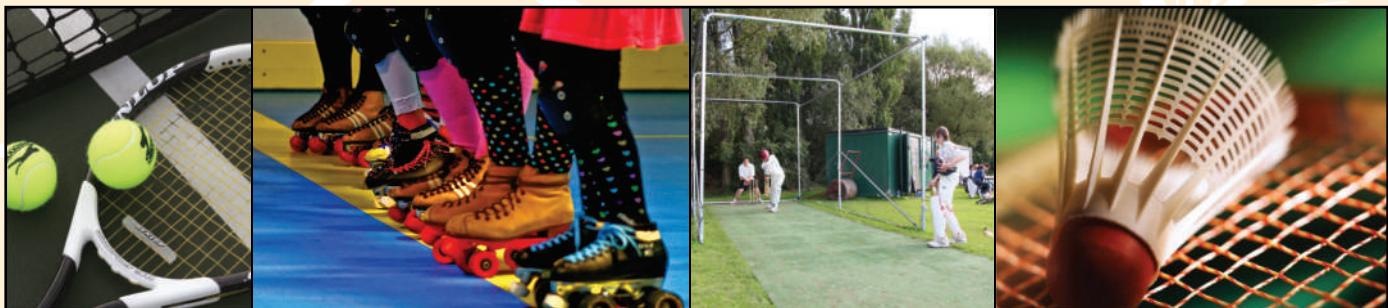
LAWN TENNIS COURT