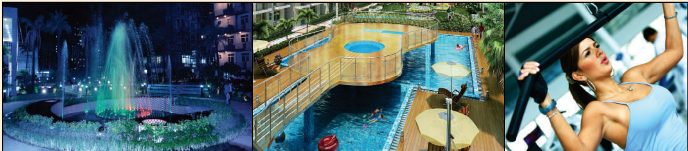
MUSICAL FOUNTAIN POOL T.T. BILLIARDS GYMNASIUM COMMUNITY HALL TV LOUNGE STEAM BATH & SAUNA BATH CRECHE